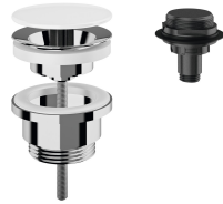
Dome waste valve, white