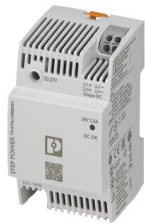
Power supply unit