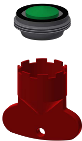
Aerator 5.0 l/min