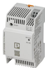
Power supply unit