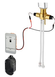
Hygiene unit for in-wall installation for F5L single lever mixers