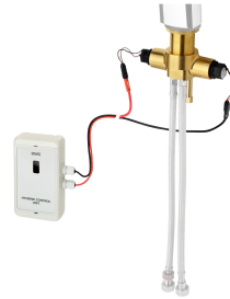
Hygiene unit for F5L single lever mixers