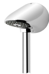
AQUAJET-Slimline shower head