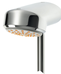
AQUAJET-Comfort shower head