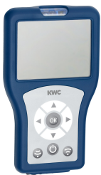
Bidirectional remote control for electrical fittings F3 and F5