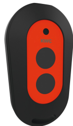
2-button remote control for fittings F3 and F5