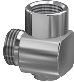
Drain valve for automatic shower hose drainage