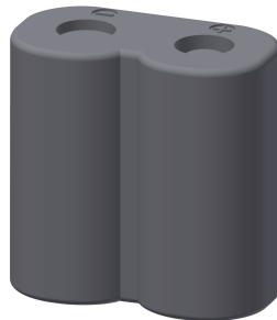
Lithium battery 6 V