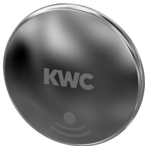
Cap for F3E