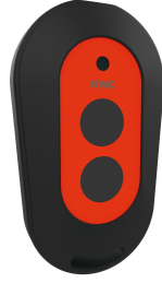
2-button remote control for fittings F3 and F5