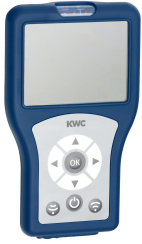
Bidirectional remote control for electronic fittings F3 and F5

Flushing systems | Electronic urinal flushing systems