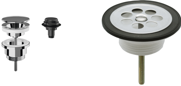
Dome waste valve, chrome-plated