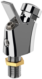
ANIMA drinking fountain tap