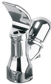
Self-closing drinking bubbler