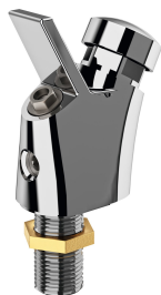
ANIMA drinking fountain tap

Modell-Linie: ANIMA | ANMX32L Drinking fountains | Drinking fountains