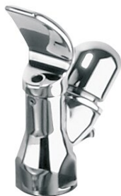
Self-closing drinking bubbler