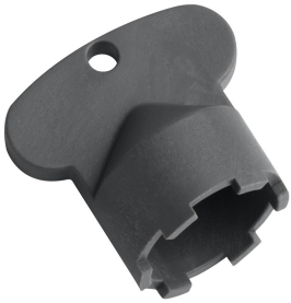
Service key Neoperl © Caché ©, STD, 24 mm, grey